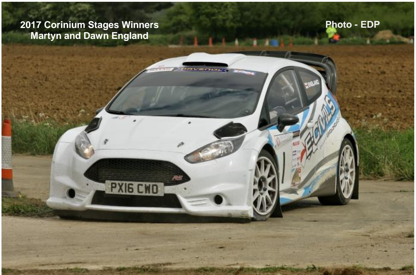
2017 Corinium Stages Winners Martyn and Dawn England